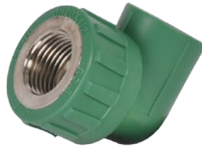
90° elbow Female Thread