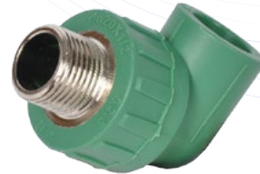
90° elbow Male Thread