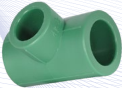
Tee with reduction